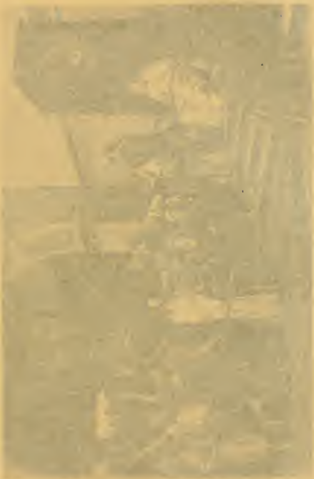
Christ below Plate